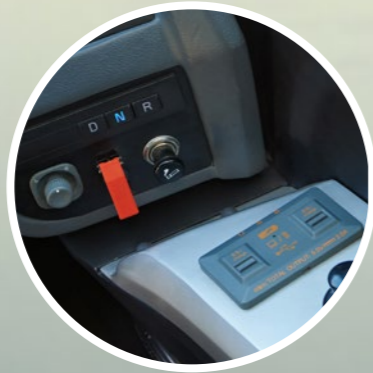
USB and 12v outlet for the driver