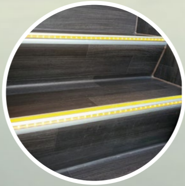
LED illuminated entrance steps