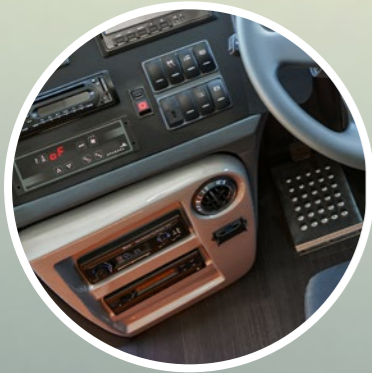
Radio, PA, DVD with USB and MP3 on the dashboard