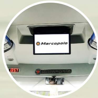
22-inch foldable LCD monitor