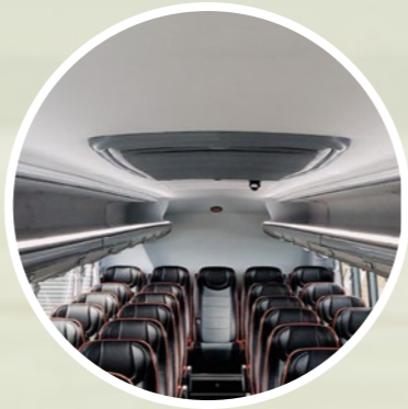
Internal luggage racks