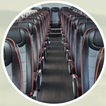
Marine plywood flooring with heavy duty non-slip floor covering material